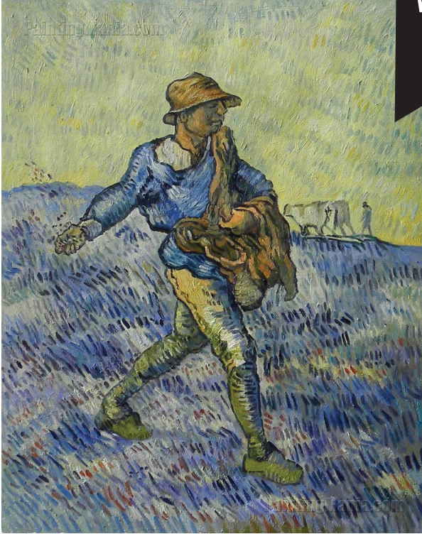
The Sower (after Millet) -Vincent van Gogh