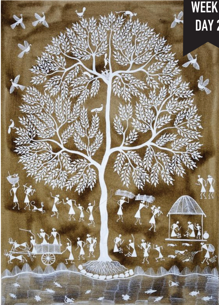
Indian Folk Art