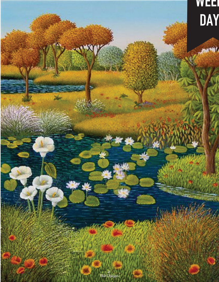
Waterlilies by Cesare Marchesini