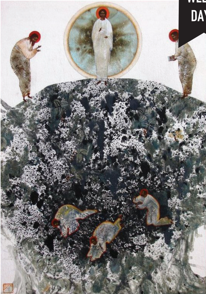
Transfiguration by Ivanka Demch