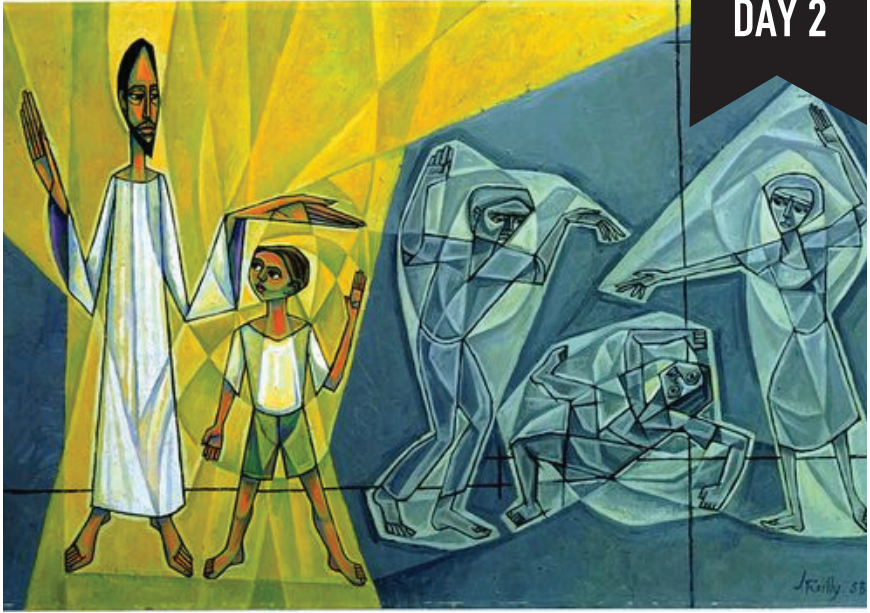
Healing of the lunatic boy by unknown