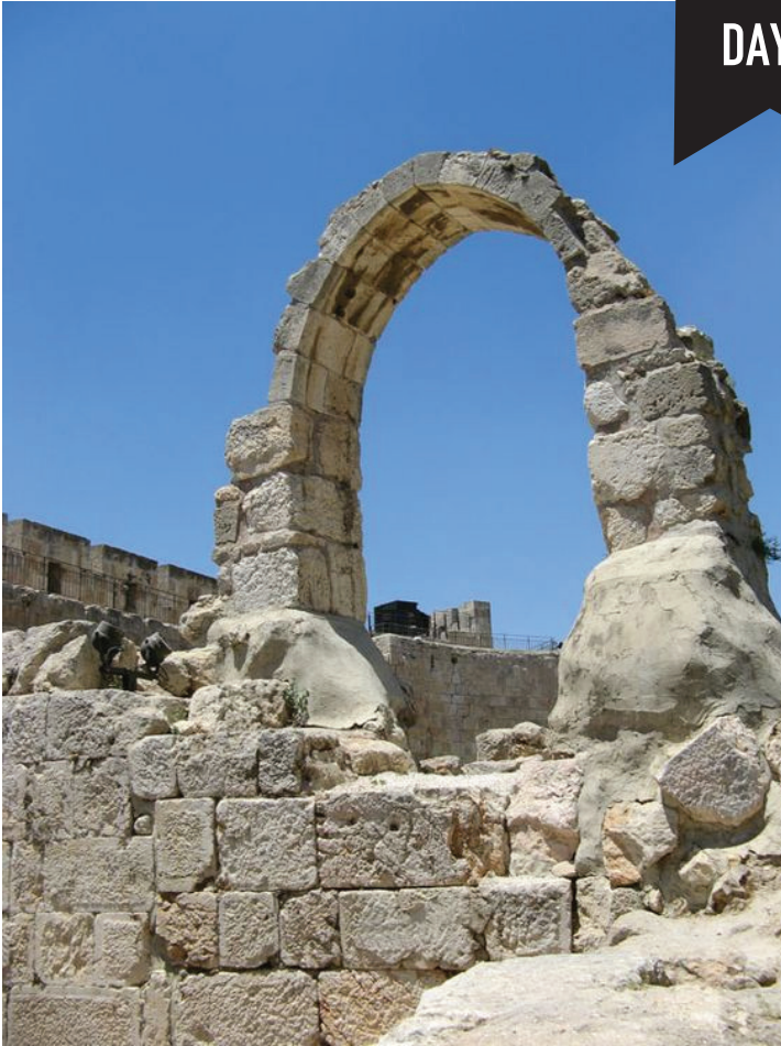
arch in Jerusalem, near Migdal David in the old city