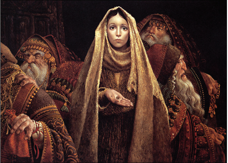
Widow's mite by unknown artist